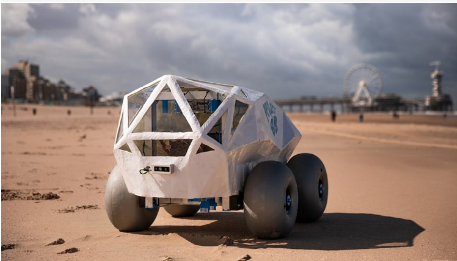
Photo: BeachBot on the boardwalk at Scheveningen Beach.

HAPPY NEW YEARS To all our SHBC Members.