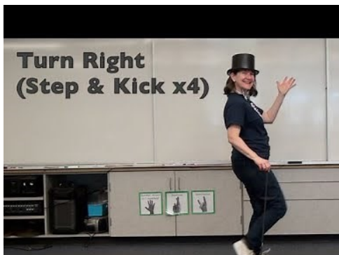
"New York, New York" Dance Steps & Tutorial

https://www.youtube.com/watch?v= ddTfTSU9Sw