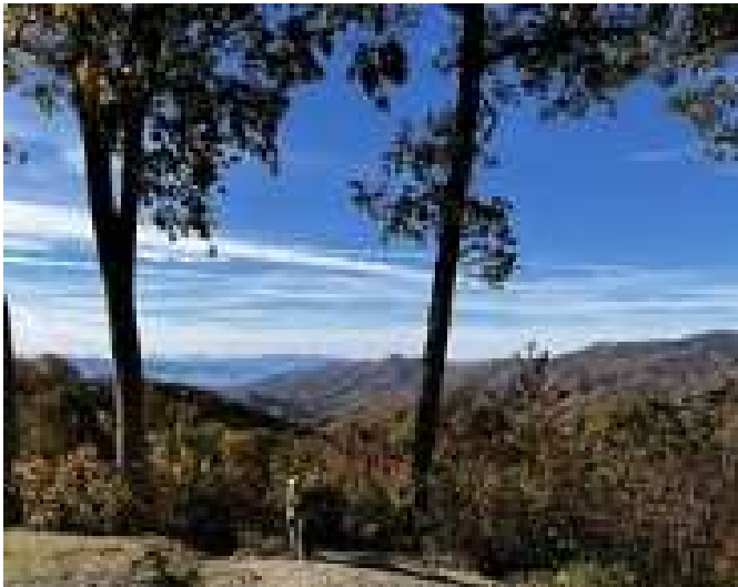
MARION in the Blue Ridge Mountains