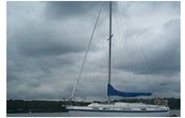
Morgan Out island 28