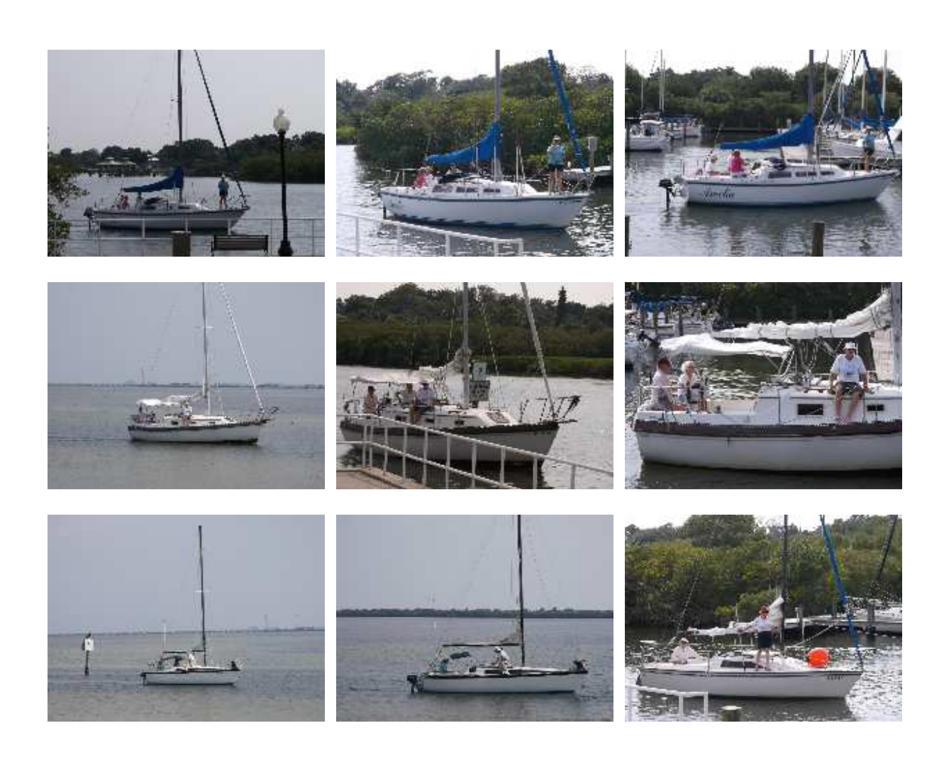
Memorial Day Picnic