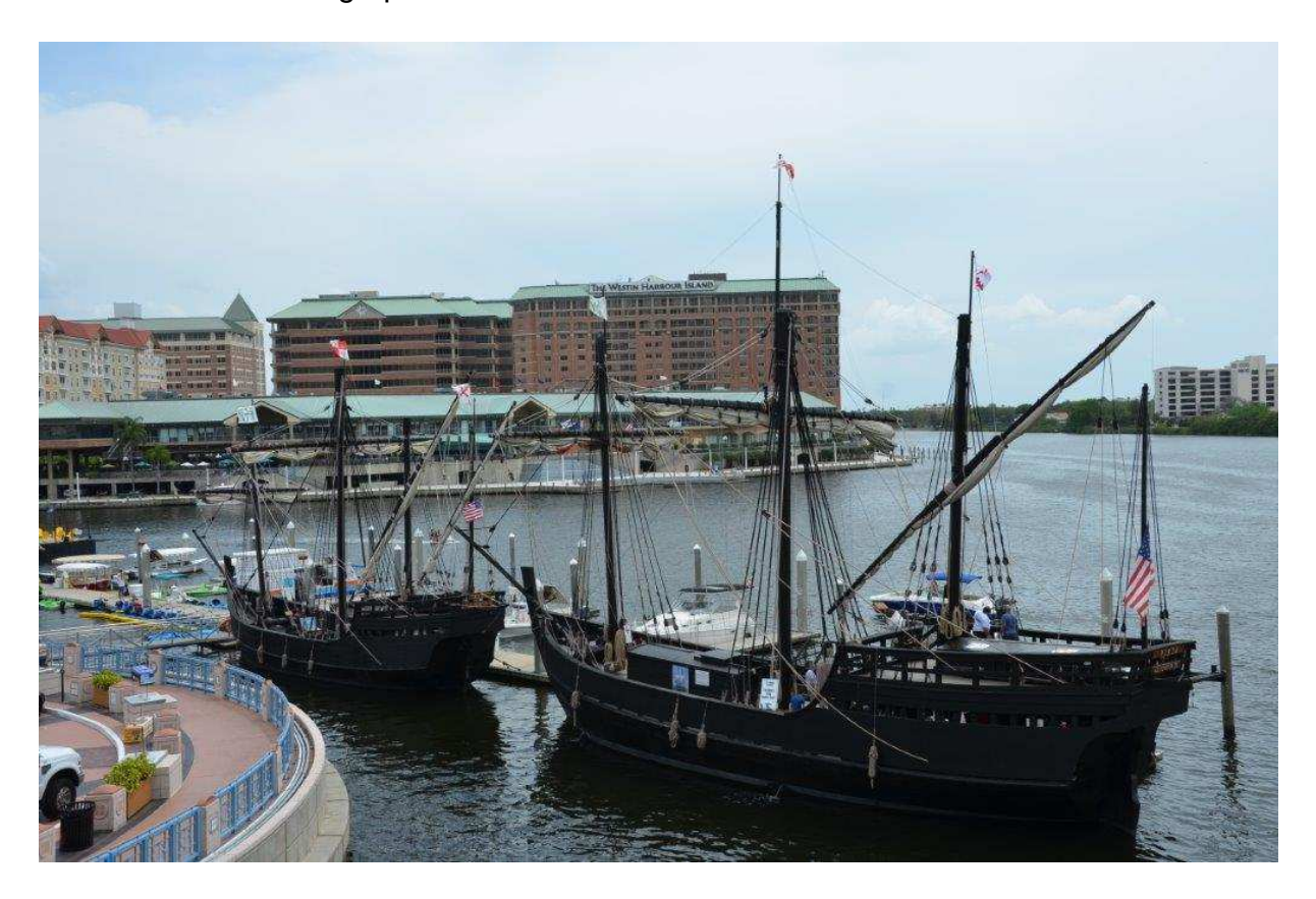
The Niña & Pinta in downtown Tampa today. My family had dinner in Tampa and I remembered the ships were there.