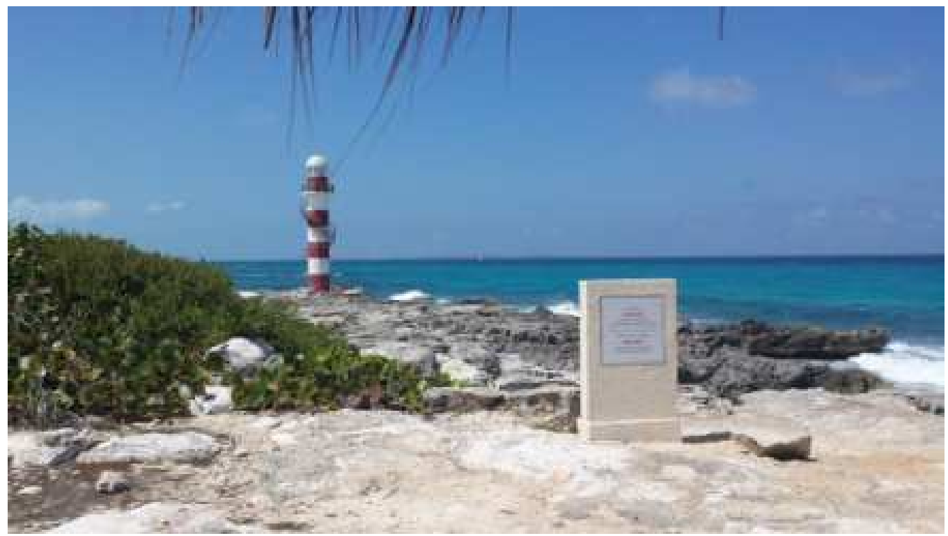
[The white dot on the horizon, in the middle, is the sailboat.]