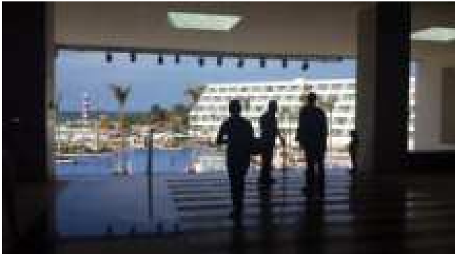
Finally, I have included a few shots of the hotel area. It sits on a point of land, so you can see miles of water on both sides (Caribbean on the left and the lagoon on the right) from the middle of the building. Google " Hyatt Ziva Cancun " for more information on this amazing destination.