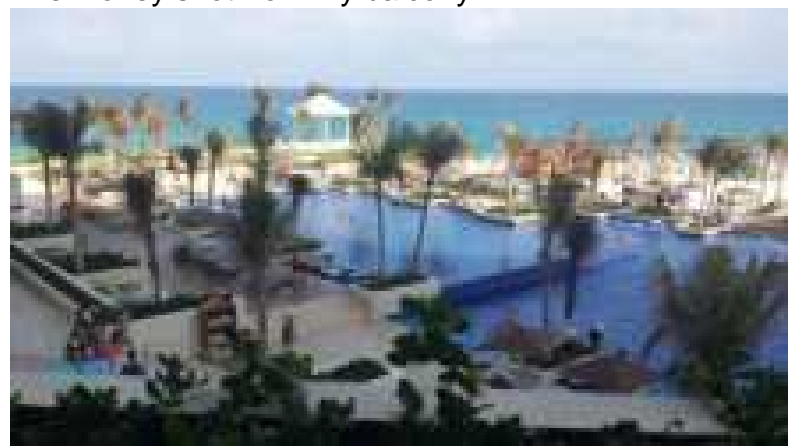
And yep, I do have bikini-induced blurry vision.