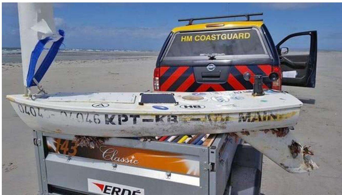
The Scottish coast guard was initially puzzled by the boat that washed ashore.

The boat was built in partnership with The Landing School, a yacht design and building program in Arundel, Maine, and the Kennebunkport Conservation Trust, with an $1,800 grant from San Francisco-based RSF Social Finance. All told, the diminutive craft sailed more than 2,800 miles (as the crow flies), making a beeline for Spain before veering south toward Morocco. It came within 100 miles of Portugal before (probably due to a storm) heading back out to sea.