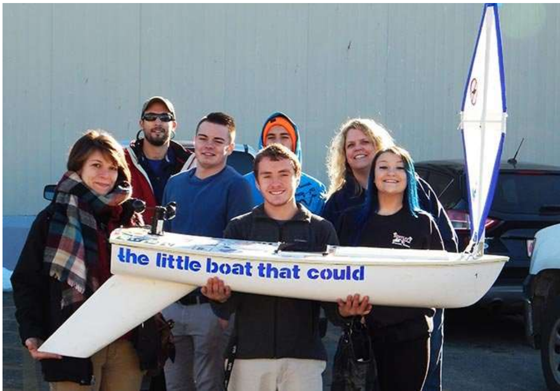
This little sailboat recently completed a very big ocean passage.

Anyone who's ever sailed across the Atlantic will tell you that it's not a piece of cake — particularly in the middle of the winter. What's typically a three- to four-week passage turned into a 169-day ordeal for one sailboat, crewed by a bunch of high school-aged kids. Don't worry. None of them were aboard to suffer the constant winter gales, giant swells, and cold rains on the aptly named 5-foot vessel, The Little Boat That Could .