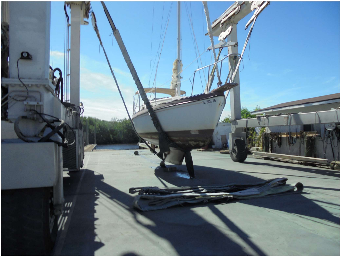
Figure 2: Sailboat being hauled by Travel-lift