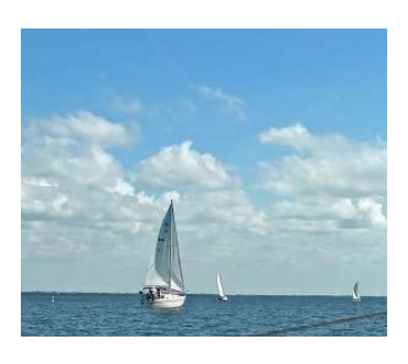
Dale C. , as usual hosted the post-race party aboard "Incentive". Fortunately, it had been glorious weather for the race and the party for our annual Back Bay Triangle Regatta.

before "Wanderlust", which owed them time, so "Wanderlust" slipped back to 4th place. Meanwhile, we on "Floribean", after having pulled up our centerboard and easing the main halyard, we set the pole on the leeward side on a very broad port reach and also shifted our weight to leeward. We then gybed our jib and went wing-on-wing and started to gain on the group just ahead. "Floribean" finished just 1 min. 7 sec. behind "Incentive" and about 1 min. 5 sec. behind "Wanderlust", so it's possible that we corrected over them.