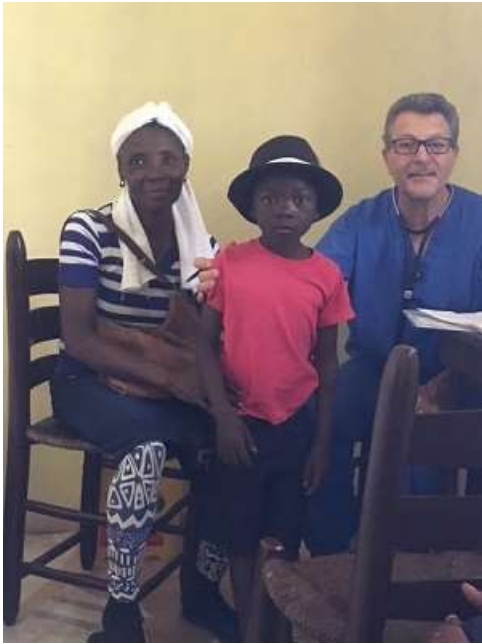
Another patient and family member.