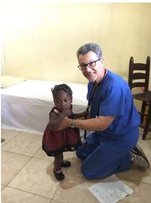
In Beausejour, one of the patients.