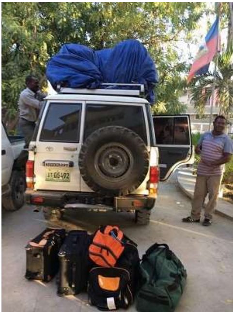
Packing to go to Beausejour from Matthew 25 House in Port-au-Prince.