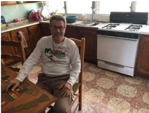
Back at Matthew 25 House in Port-au-Prince