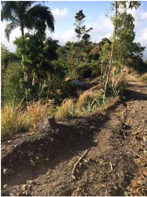
The road to and from the mission.