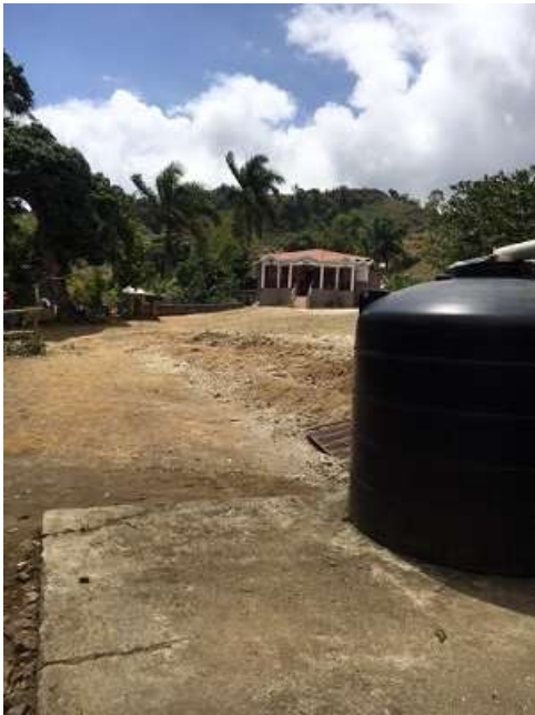
A view of the clinic from our quarters.