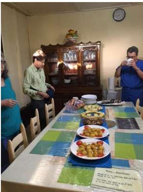
Breakfast at the mission.