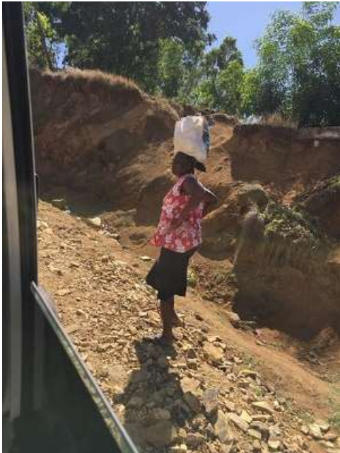
On the way to Beausejour.