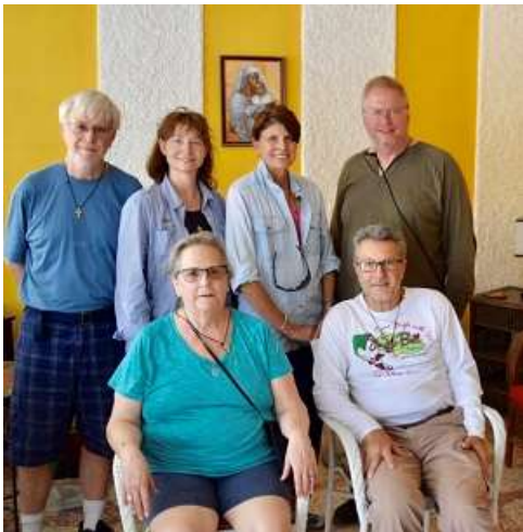
The crew (this image was taken at the end of the trip).

Here is a short visual synopsis of our trip to Beausejour Haiti: