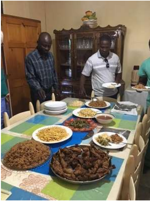
Dinner at the mission.