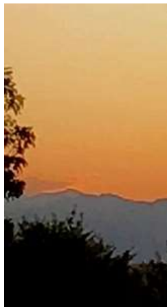
Sunset in the Rockies! Purple Mountain Majesties!