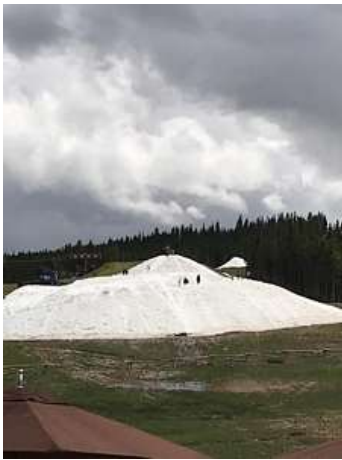
Snow hiking in July