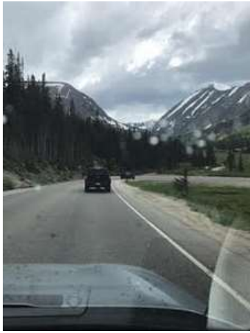
I-70 Approaching the Eisenhower Tunnel