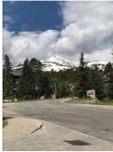
Lots of "Switchbacks" in the Mountains