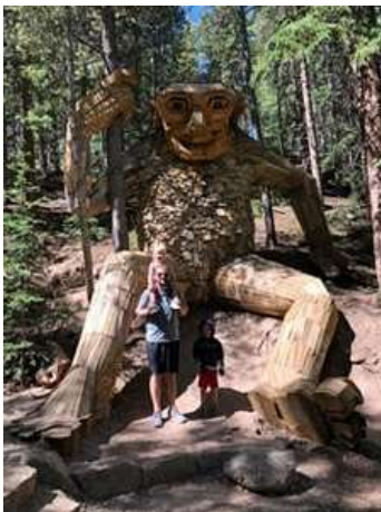
Perhaps our Ancestors