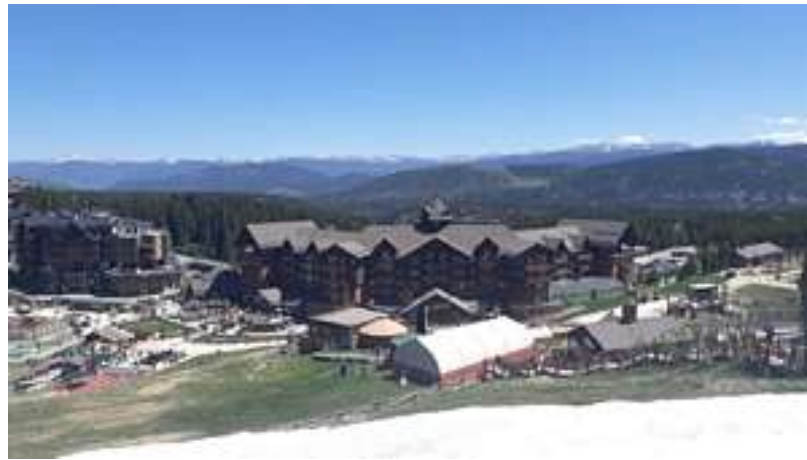
The Main Breckenridge Ski Lodge