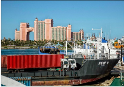
A modern MailBoat is being loaded at Potters Cay with the backdrop of Mega-Resorts located on nearby Paradise Island.

A lifelong sailor tried a different way to cruise The Bahamas - MailBoats! Spared from navigational duties and weather planning requirements of cruising sailors, mailboats brought their own set of travel challenges. It all turned into a grand adventure for this sailor and old septuagenarian friends! Travel along with us and visit the real Bahamas and meet real Bahamians! Learn something about a beautiful, interesting, and friendly country and about mailboats and how to travel on them. Partake in our adventures, and then maybe go yourself!!