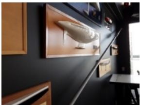
04 = Model of foil sail boat hull on Sailing Club, Half Moon Bay, near Auckland