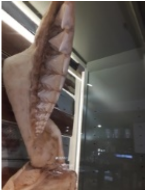
03 = Sharks endless replacement teeth