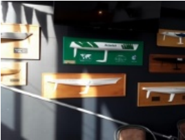
07 = Various foils for sail boats used in Americas Cup