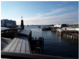
05 = (no text)