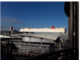
10 = Car carrier in Auckland Harbour.