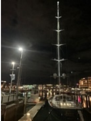
01 = US super yacht in Auckland Harbour. July 5th. 2021