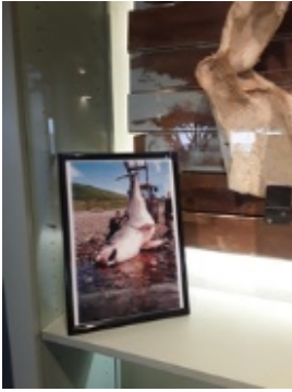
06 = Shark teeth in restaurant on Waiheke Island New Zealand