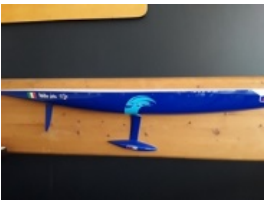
08 = Foil on hull for above water sail boats