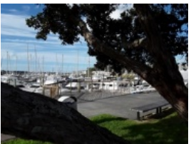
09 = City of sails Auckland