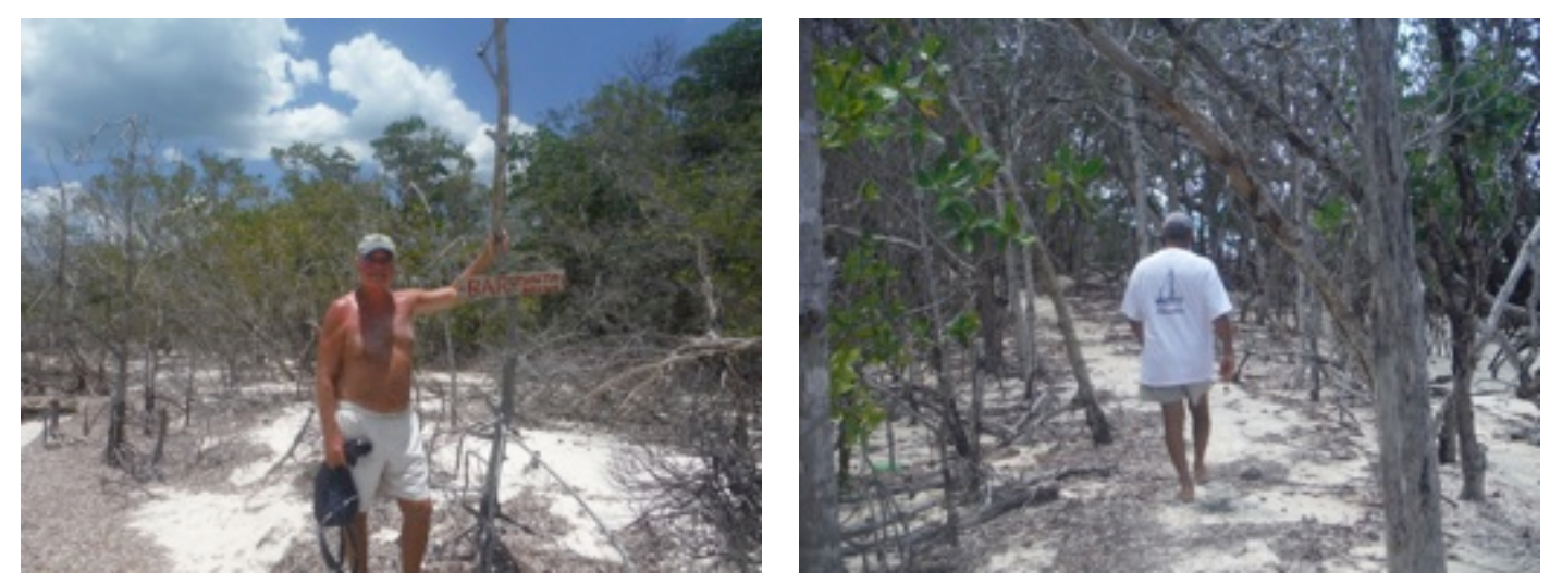
Don't worry, the bar is just up ahead!!

Every day at Cayo Levisa was uniformly the same, another day in Paradise. We would arrive by dinghy in mid-morning, in time to beat the day trippers to the beach chairs. We'd read, nap, snorkel off the beach a little, and visit the beach bar occasionally. In the afternoon, we'd take an amazing excursion down the beach, through a patch of mangroves, to find the Punta de Arenas Bar.