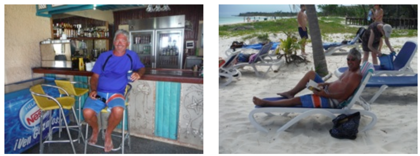
The resort's beach and beach bar. During our four days, we saw plenty of both!